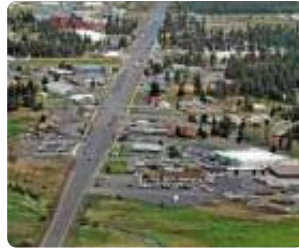
City of La Pine from the south

Approved in April 2008, the Deschutes County Rural Enterprise Zone (E-zone) encompasses the Bend Airport and the City of La Pine. The Rural E-zone offers traded-sector employers (companies that sell goods or services outside the local area and expand its economic base) and other eligible companies three (3) to five (5) year property tax exemptions on certain new capital investments that create jobs in the designated areas. The zone is sponsored by Deschutes County and the City of La Pine and is managed by Economic Development for Central Oregon (EDCO). Only new facilities or improvements not yet on the tax roll are eligible for this tax incentive.